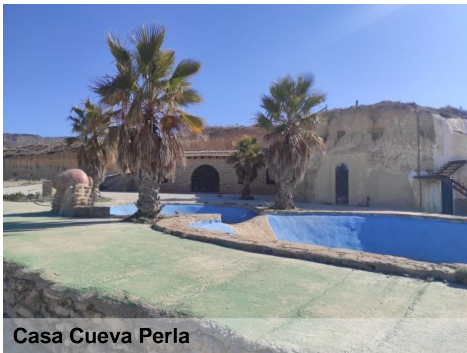
Casa Cueva Perla